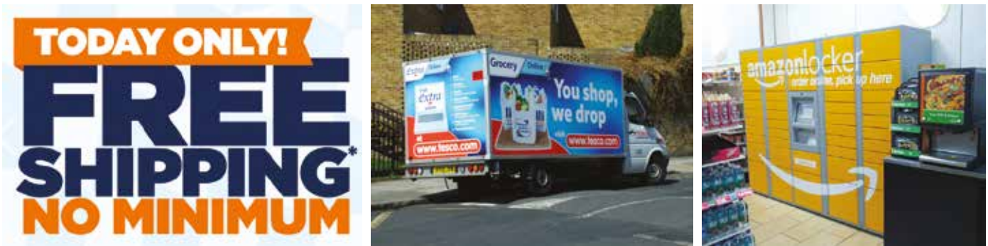
Fig 2. the changing face of shopping vii

types of cargo dependent shopping to be identified which were much more likely to be associated with the car v . Some kinds of shopping trips will be harder to do by non-car modes unless they can be replaced by home deliveries. However, this only helps if the home delivery replaces the trip to the store rather than adds to it.